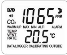
(Display Features and Modes)